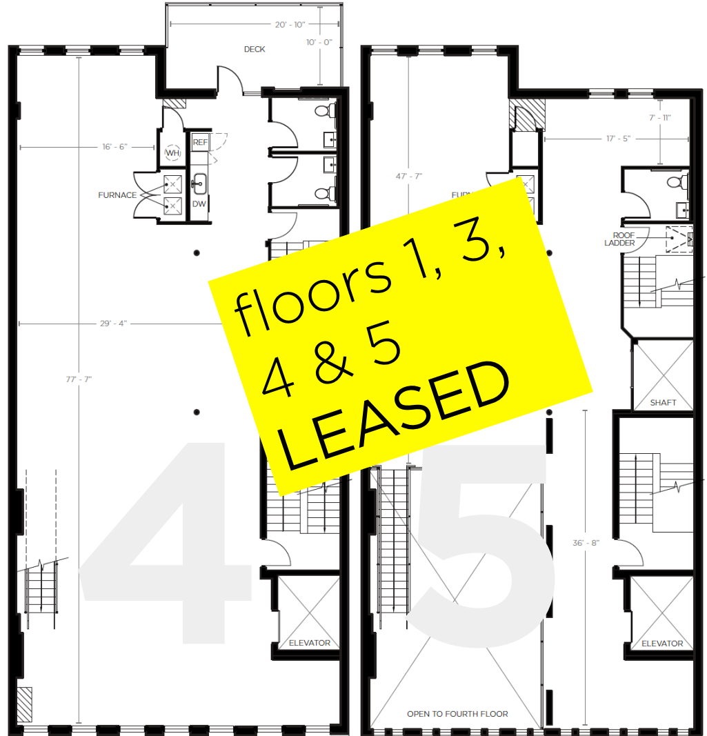
FIFTH FLOOR MEZZANINE